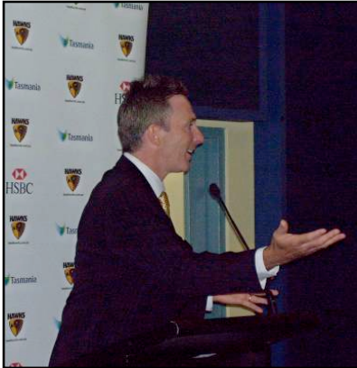
How's that umpire ?